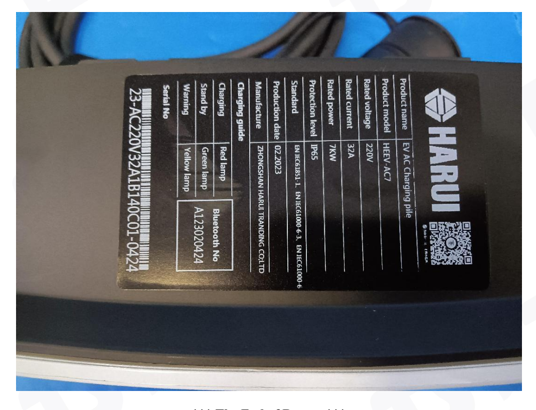
*** The End of Report ***